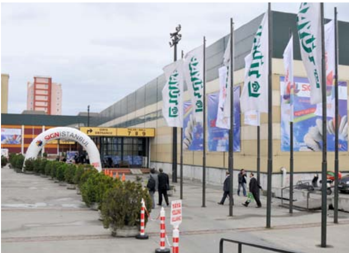
Sign Istanbul 2010 trade show entry.