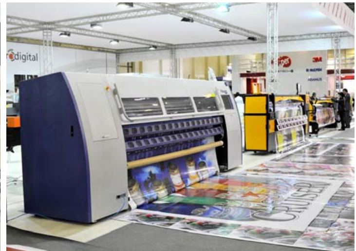
D.G.I. Polajet 3204D printing samples at Pimms booth.