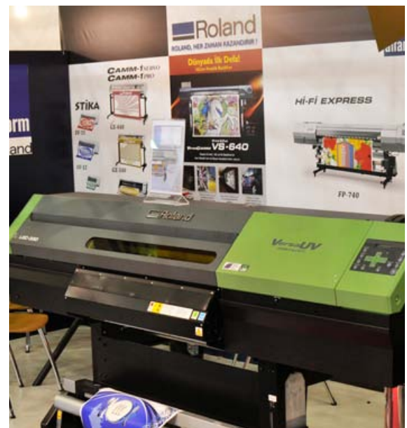
Roland Versa UV LEC-330, Alfannorm booth