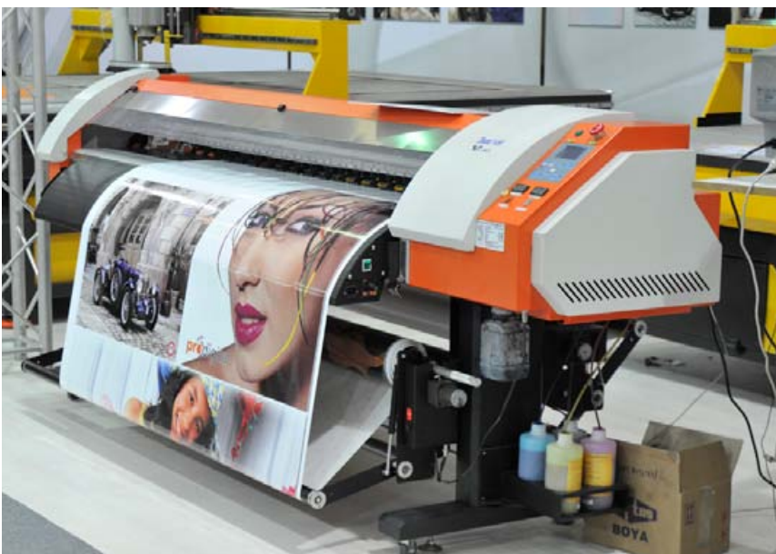
Pimms Prodigital booth.