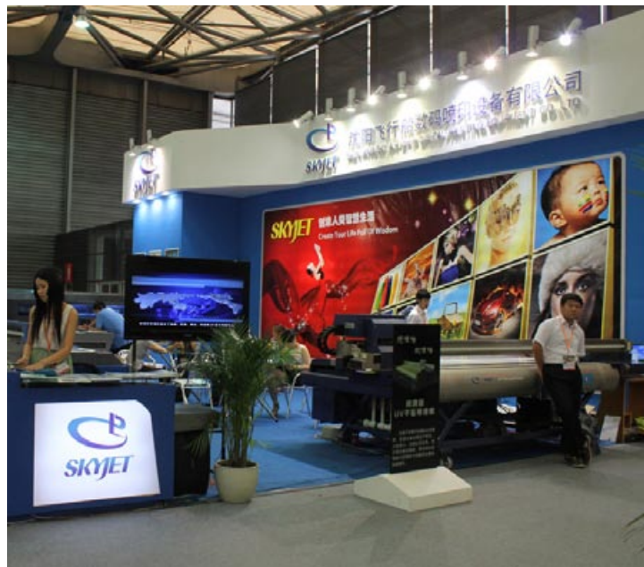
Sky Air-Ship booth.

FLAAR also offers these FREE Reports available for download at