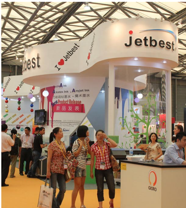
Jetbest Inks booth.

AT Inks Jetbest Alphachem Jetga Apollo Inks Myiak ink Bcinks Nano ink BPink Nazar Chenbang inkjet Nova inks Chromo ink Pengbo ink jet ink Durafos Real colour Enkle ink Richcolor Fortuna Sam-ink Fuji Saven ink Gateway Sepiax chimigraf Gunsjet ink - Digitex Sicol Hongsam SJ -D5 Huanmei Spectra Huaxin-micolor ink Sunjet Ink 2000 Swe ink Ink eco Techmed ink jet Inkbank Tonjou chemical industrial Inkrank Toyo ink Inktec Triangle INK InkTech Weifang Inkvay Wer InkWin Xianglin ink - weixin digital Jetall Zeus CO