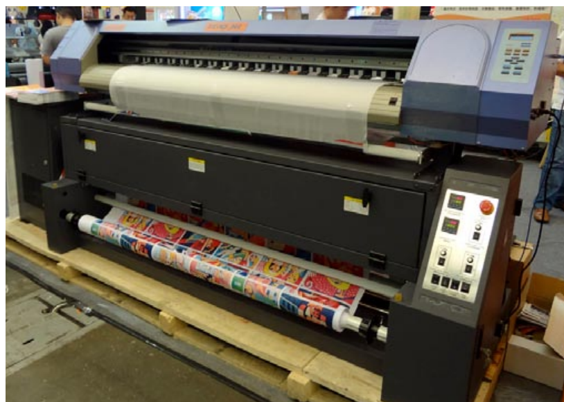
Hongsam HongJet textile printer.