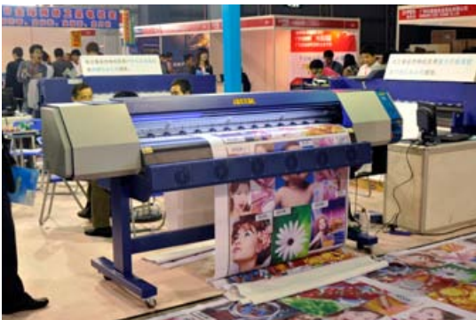
Jettek solvent printer.