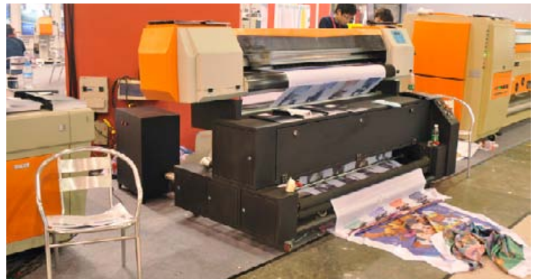
Zhongye textile printer.