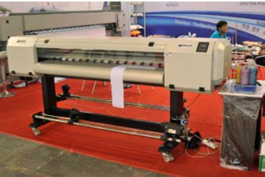
Sprinter S1600 printer.