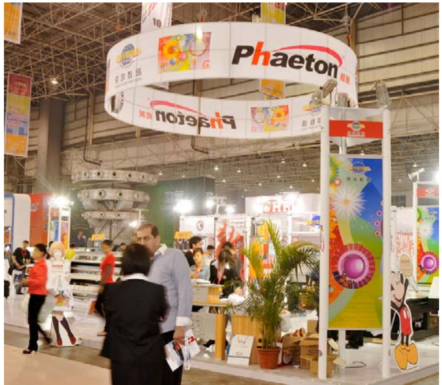
Phaeton printer with a Epson DX5 print head.