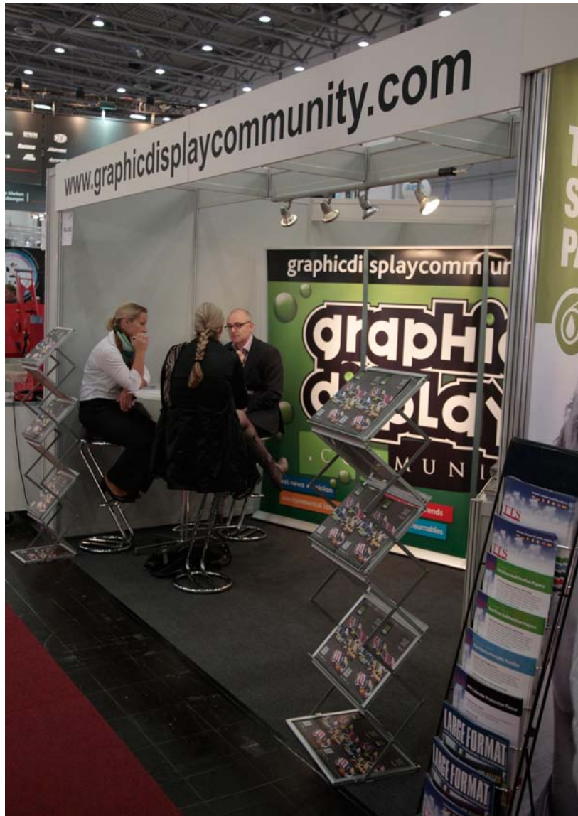
GraphicDisplayCommunity trade magazine booth

The magazine we know the best for German language areas is SIP, published by WNP Verlag, in Munich.