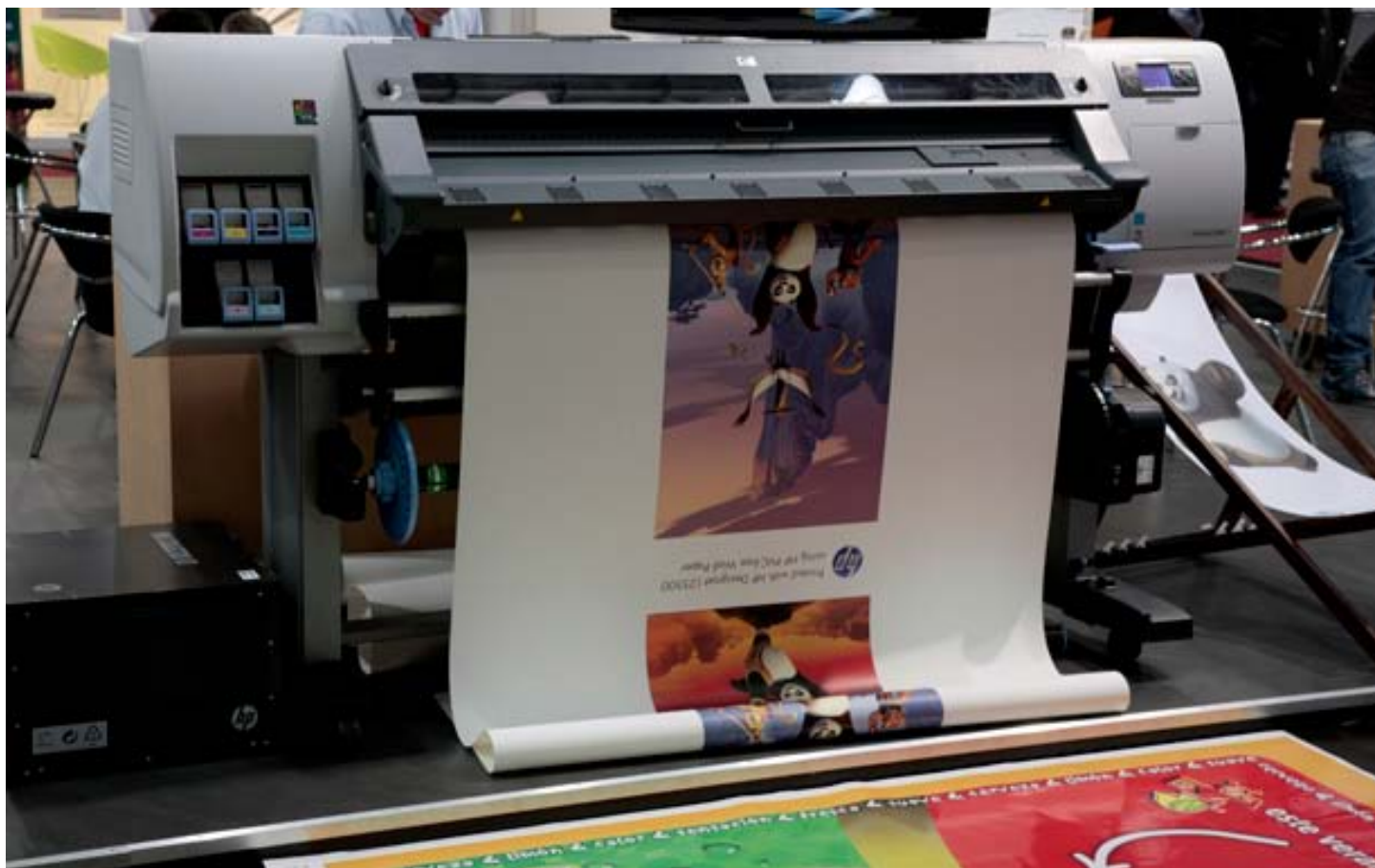
HP latex ink printer

D.G.I. was conspicuous by its absence: no solvent and not even any textile printers.