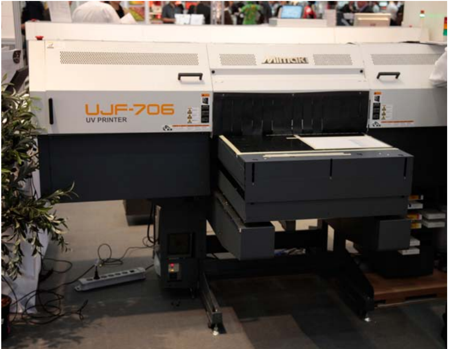
Mimaki UJF-706 uv flatbed

Roland Versa UV LEF-12 (desktop sized). One in Roland booth, one elsewhere. Roland 640 with table in booth of Roland Roland LEC-540, all in Roland booth Roland LE-640 with table in booth of Gröner