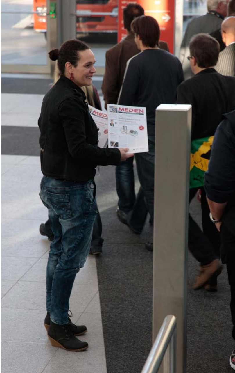
Handing out magazines, but this was not a Show Daily.

Most trade shows have a Show Daily (albeit they are 90% PR releases and other forms of advertising). But if there was any Show Daily here, it was well hidden.