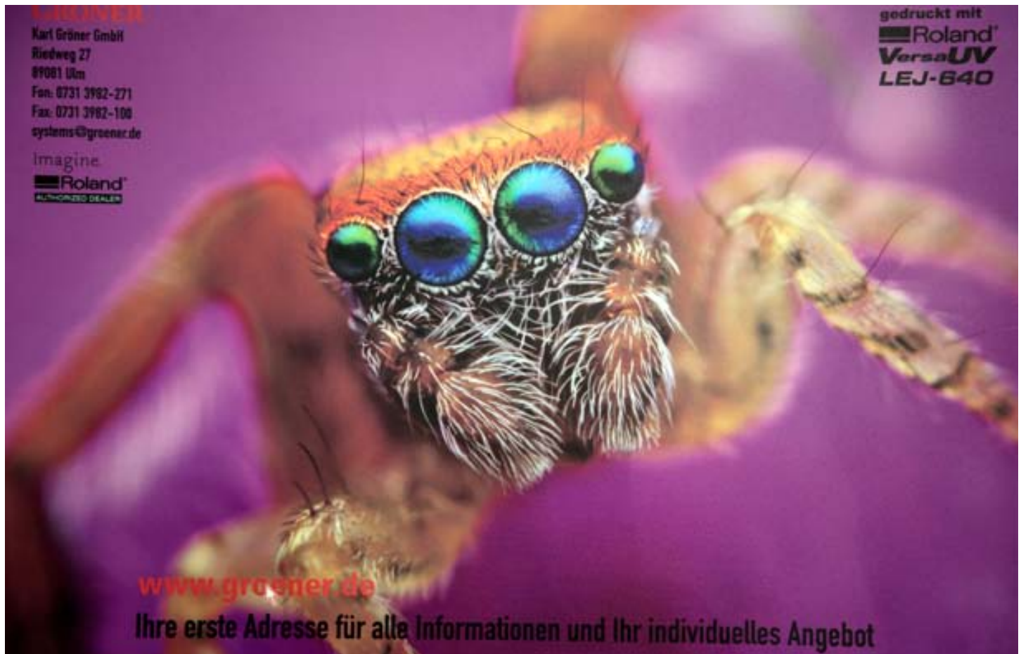
Spider photo example Gröner booth