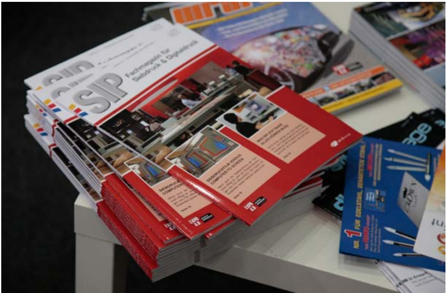
SIP magazines examples